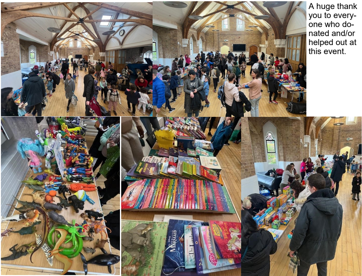
A huge thank you to everyone who donated and/or helped out at this event.