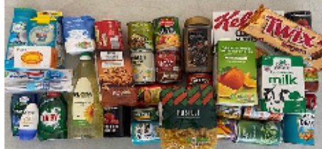
A well balanced 3-day emergency for 1 person could mirror the photo above. (Cost per package may vary according to availability*).

EVERY £40 RECEIVED IN CASH DONATIONS PAYS FOR ONE EMERGENCY PACKAGE*