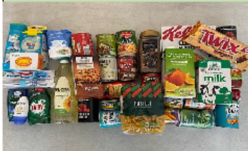
A well balanced 3-day emergency for 1 person could mirror the photo above. (Cost per package may vary according to availability*).

EVERY £40 RECEIVED IN CASH DONATIONS PAYS FOR ONE EMERGENCY PACKAGE*